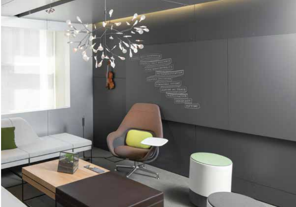
Gray Chalk 6502 C